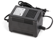
AC24V/3A Power Supply